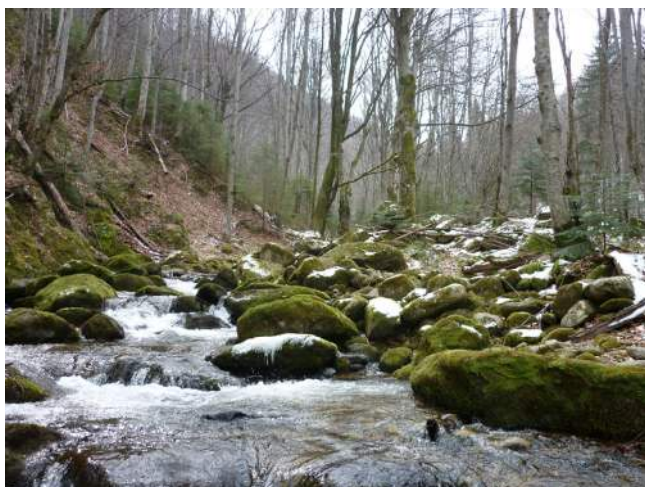
FIGURE 2 Middle course of Râul Alb [Color figure can be viewed at wileyonlinelibrary.com ]

The fluvial valley begins by eroding the bottom of the glacial valley. It is in the upper coniferous belt where the crenon-rhithron ecotone is situated on Râul Alb. Downstream, the river current is fast, causing many white water ripples that give the river its name (the White River). The terminal moraine, cut by the riverbed to a depth of 10 m, is situated at an elevation of 1,050 m (Urdea, 2000). Lower still, an old growth beech forest takes the place of the mixed coniferous forest. Headwater riparian zones are covered by the same zonal